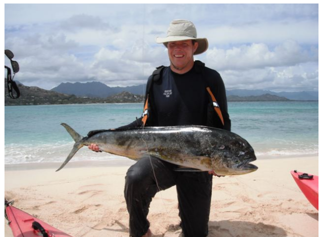
A 32 lb. Mahi-mahi caught Oct. 2 nd outside Kaneohe Bay