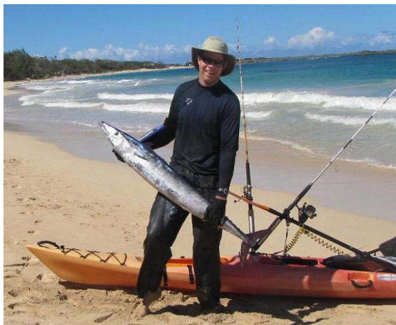
A 32 lb. Ono caught Sept. 25 th outside Punalu`u

Below are a couple of the fish caught by Stan during the year.